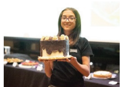
Scarlett displays a chocolate peanut butter cake during the dessert auction