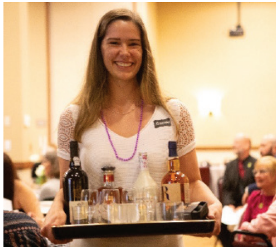
A volunteer promotes the dessert auction