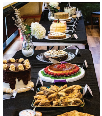
Desserts donated by talented friends of Next Step were won and enjoyed by the highest bidder.