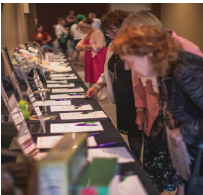
Guests enjoyed bidding on auction items