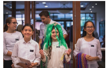
Our dedicated volunteers make our Gala possible