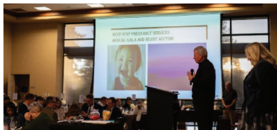
We offered thanks to God for blessing the work of Next Step and giving us such loyal and generous supporters