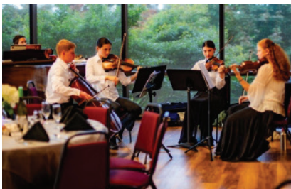
Thanks to our very talented musicians