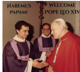
Pope John Paul II greets a young Robert Francis Prevost aka Pope Leo XIV

Omnis vita pretiosa ~ All life is precious. Continue to keep the Holy Father in your prayers and pray his affirmation of the sanctity of life will encourage more life-affirming change.